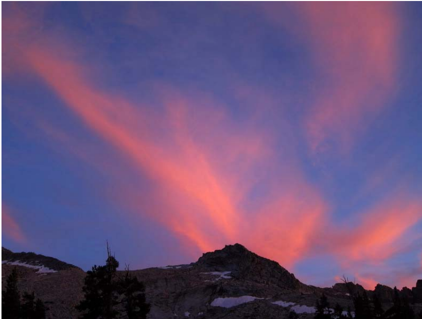
Sunset clouds in the Marble Kaweah Canyon, Sequoia National Park