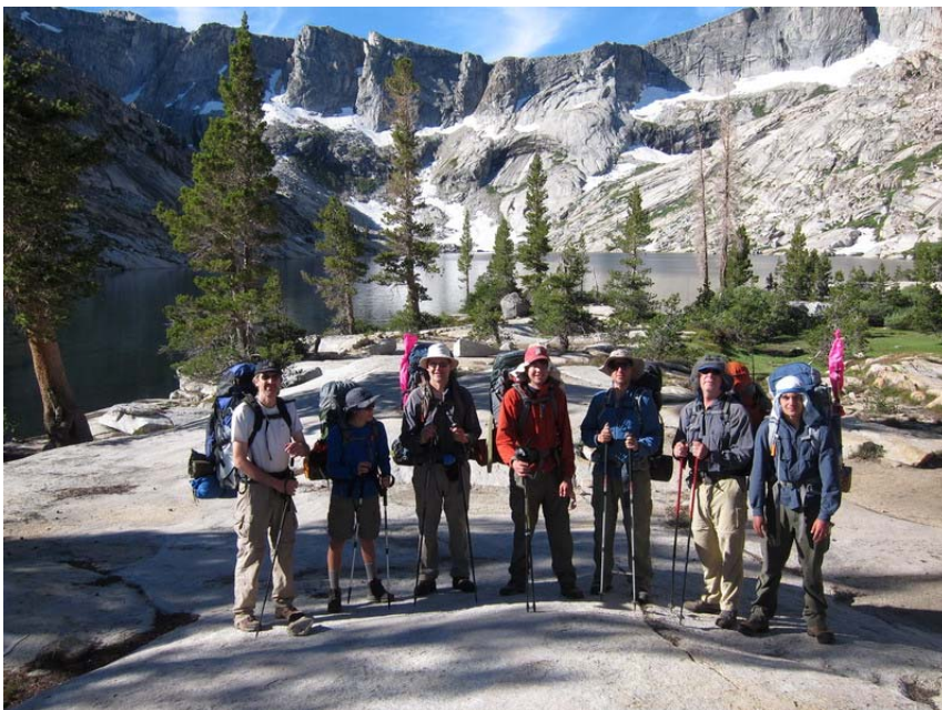
T85 at Big Bird Lake